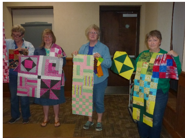
Squared Away – 4-H quilting Projects