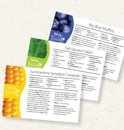
Plate it Up!

Browse and download more than 100 delicious, healthy recipes from Plate it Up Kentucky Proud.