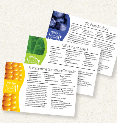
Plate it Up!

Browse and download more than 100 delicious, healthy recipes from Plate it Up Kentucky Proud.