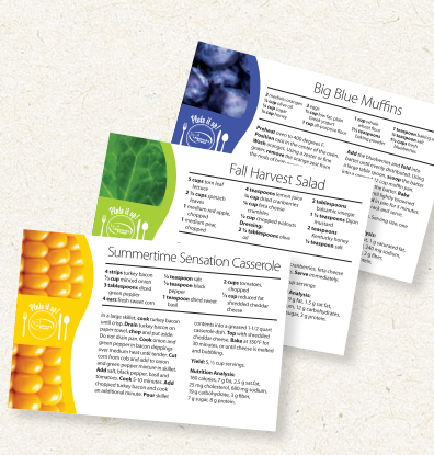
Plate it Up!

Browse and download more than 100 delicious, healthy recipes from Plate it Up Kentucky Proud.