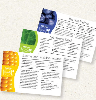
Plate it Up!

Browse and download more than 100 delicious, healthy recipes from Plate it Up Kentucky Proud.