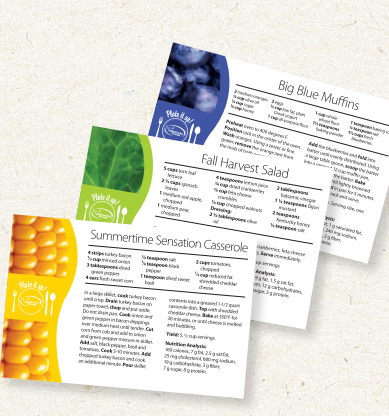
Plate it Up!

Browse and download more than 100 delicious, healthy recipes from Plate it Up Kentucky Proud.