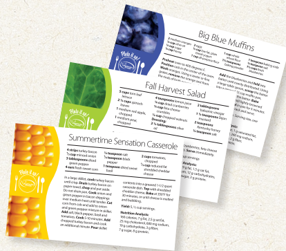
Plate it Up!

Browse and download more than 100 delicious, healthy recipes from Plate it Up Kentucky Proud.