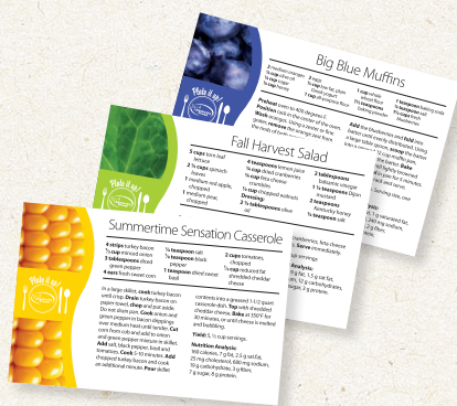
Plate it Up!

Browse and download more than 100 delicious, healthy recipes from Plate it Up Kentucky Proud.