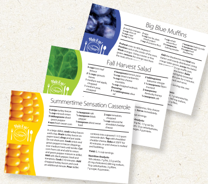
Plate it Up!

Browse and download more than 100 delicious, healthy recipes from Plate it Up Kentucky Proud.