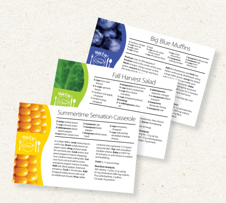
Plate it Up!

Browse and download more than 100 delicious, healthy recipes from Plate it Up Kentucky Proud.