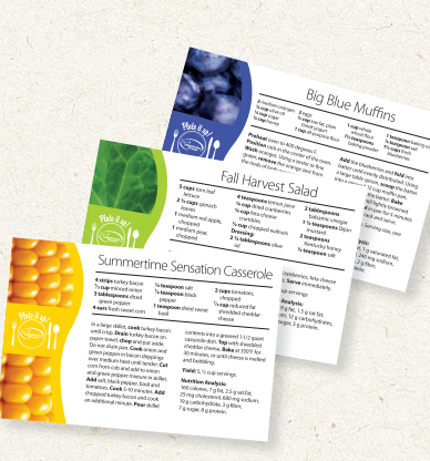
Plate it Up!

Browse and download more than 100 delicious, healthy recipes from Plate it Up Kentucky Proud.