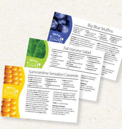
Plate it Up!

Browse and download more than 100 delicious, healthy recipes from Plate it Up Kentucky Proud.