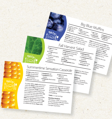
Plate it Up!

Browse and download more than 100 delicious, healthy recipes from Plate it Up Kentucky Proud.