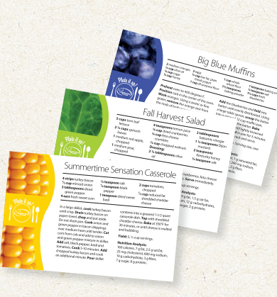
Plate it Up!

Browse and download more than 100 delicious, healthy recipes from Plate it Up Kentucky Proud.