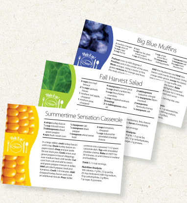
Plate it Up!

Browse and download more than 100 delicious, healthy recipes from Plate it Up Kentucky Proud.