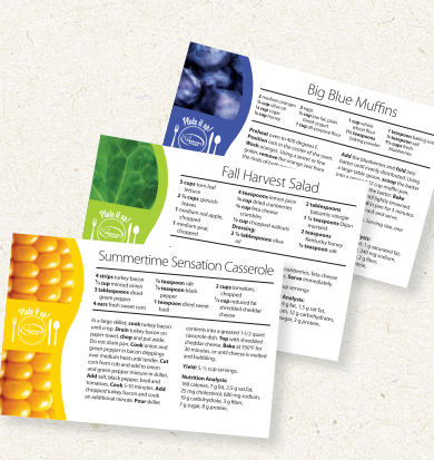
Plate it Up!

Browse and download more than 100 delicious, healthy recipes from Plate it Up Kentucky Proud.