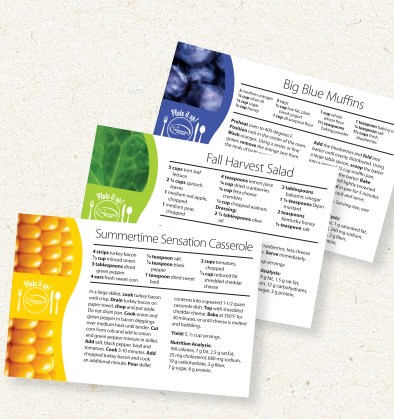
Plate it Up!

Browse and download more than 100 delicious, healthy recipes from Plate it Up Kentucky Proud.